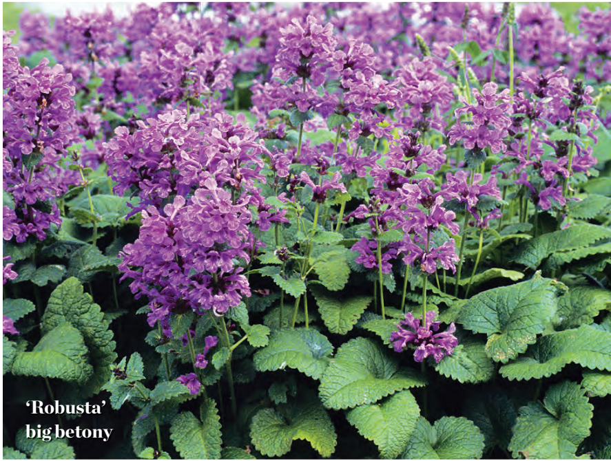
'Robusta' big betony