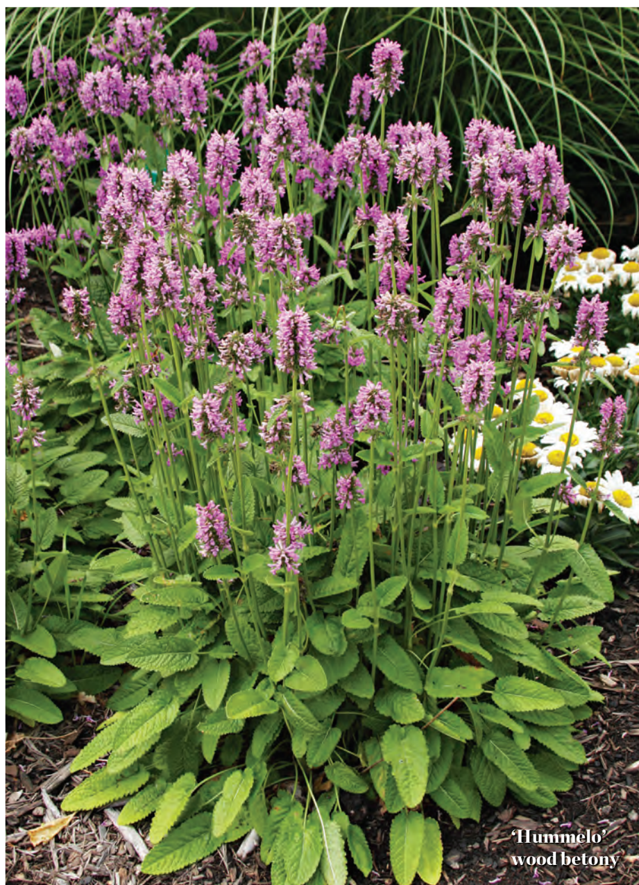
'Hummelo' wood betony

My awareness of betonies ( S. officinalis and cvs., and S. macrantha and cvs.) developed quickly after my first sighting of wood betony in an exceptional local garden. Spikes of glowing purple flowers rose above lush verdant mounds as an exclamation point in that blousy English-style border. It struck me as an uncommon stand-in for the verticality of commonplace perennials such as veronica ( Veronica spp. and cvs., Zones 4–8) and woodland salvia ( Salvia nemorosa and cvs., Zones 3–9). I spent the rest of that summer amassing a trial to learn more about the diversity of Stachys and to discover why betonies weren't more available.