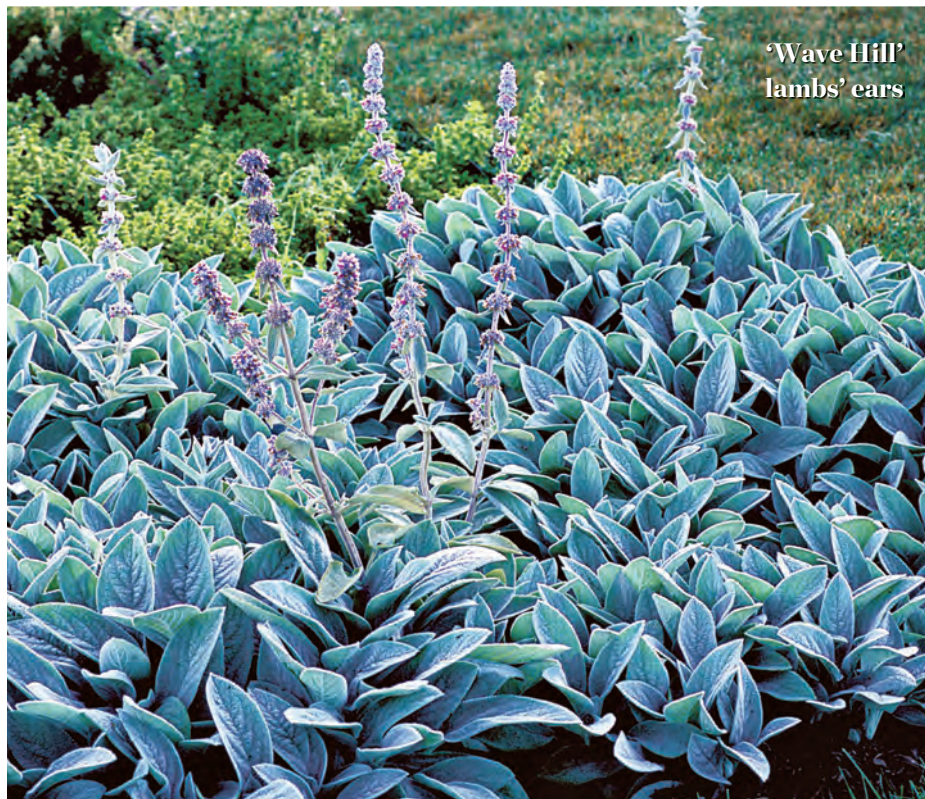
'Wave Hill' lambs' ears