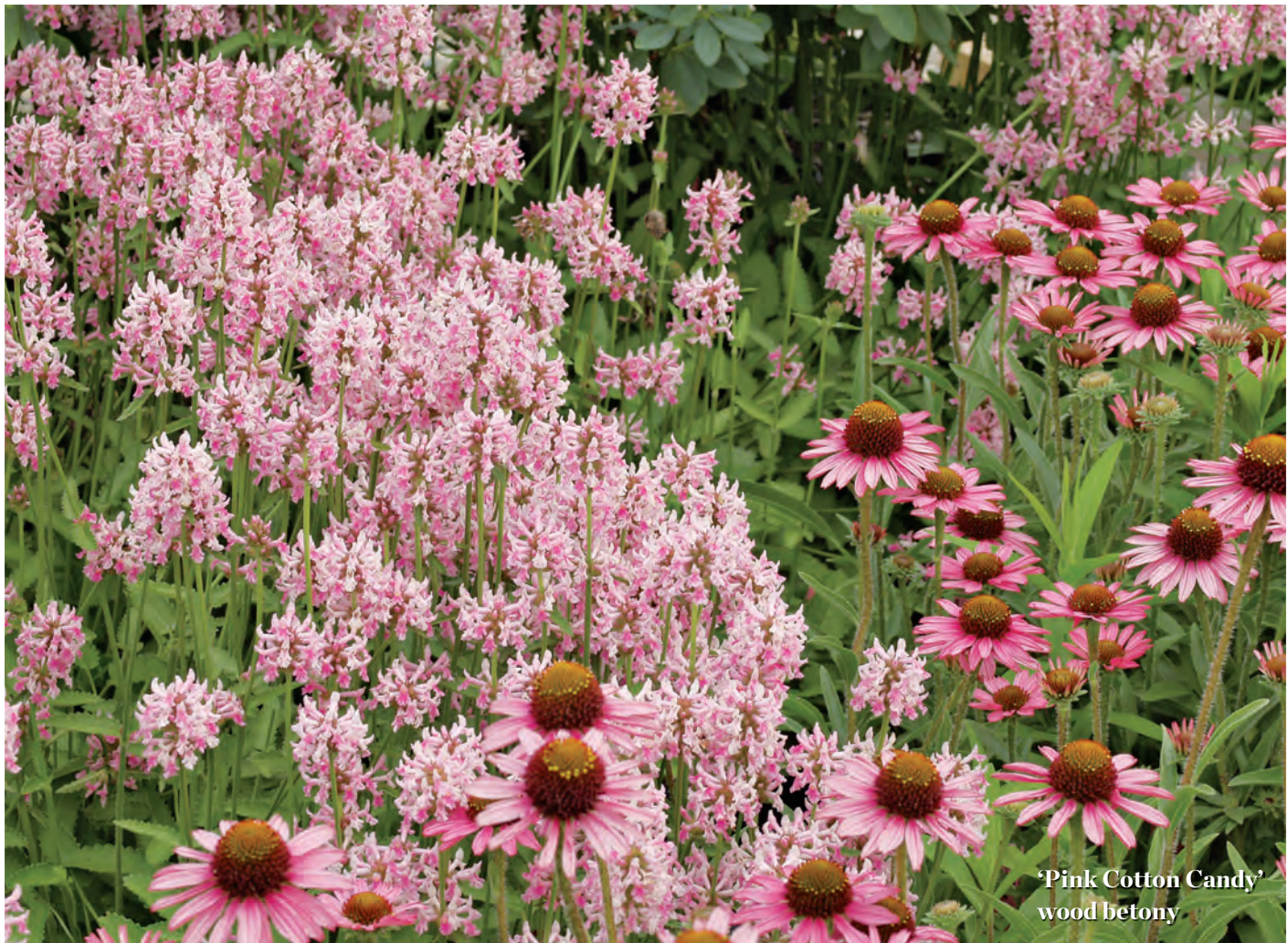
'Pink Cotton Candy' wood betony

Photos: courtesy of Intrinsic Perennial Gardens (p. 69, top); Andy and Sally Wasowski, Lady Bird Johnson Wildflower Center (p. 70, bottom right), Illustration p. 67: Chudtsankov/dreamstime.com.