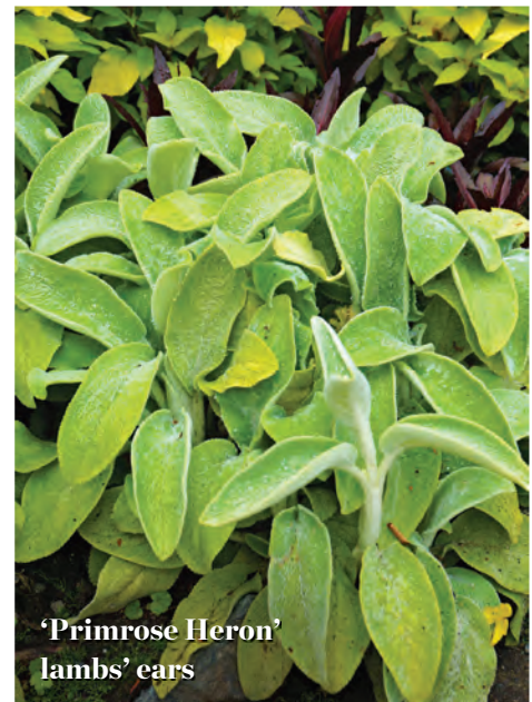
'Primrose Heron' lambs' ears