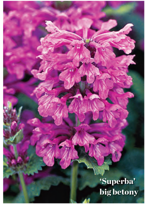
'Superba' big betony