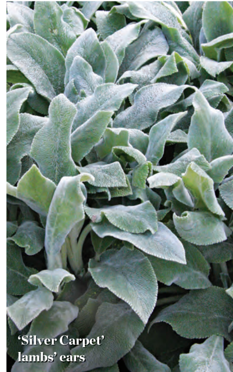
'Silver Carpet' lambs' ears