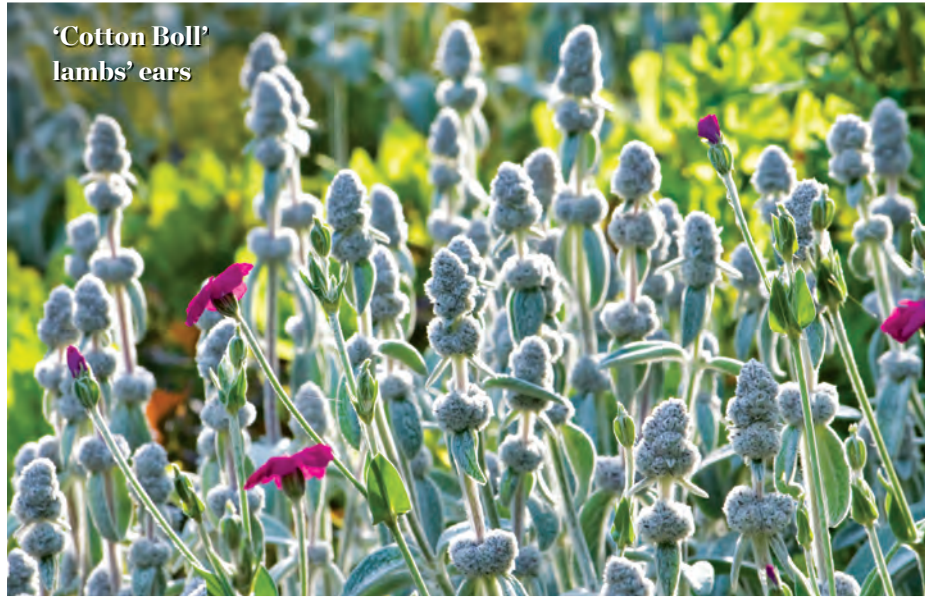
'Cotton Boll' lambs' ears