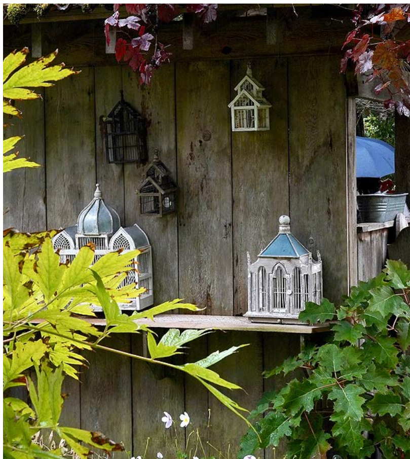
Private garden outside Vancouver

campus of UBC. We explore the new TreeWalk , a new addition to the garden. Afterward, we enjoy the beautiful Nitobe Memorial Garden , a traditional Japanese Tea and Stroll Garden, considered to be one of the most authentic Japanese gardens in North America. Lodging: Vancouver (B)