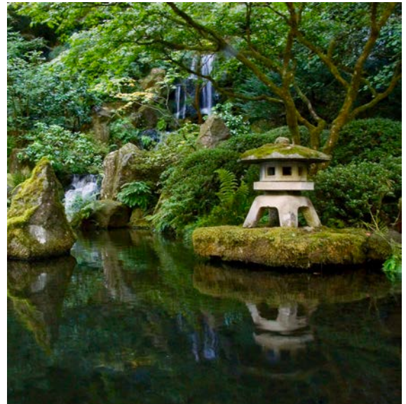
Portland Japanese Garden

Our exploration of the gardens of the Pacific Northwest