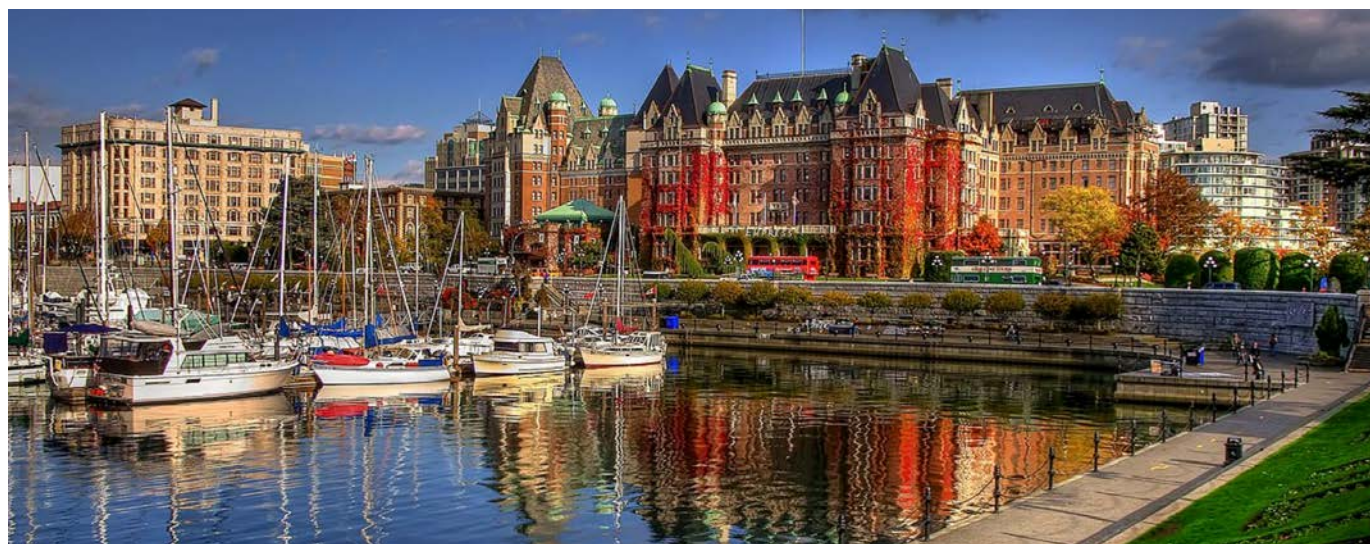
Victoria, British Columbia Harbor