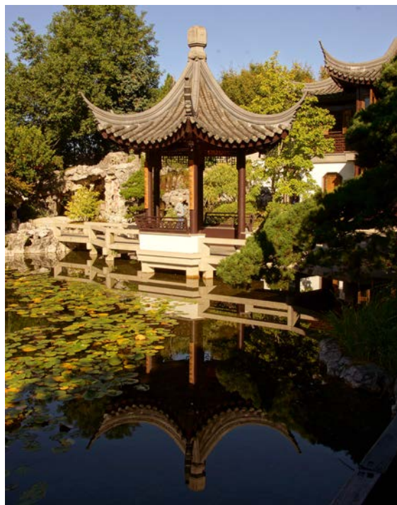
Lan Su Chinese Garden in Portland

Our morning in Vancouver begins with a driving tour of the city to see the highlights of this intriguing city by the sea. Our tour ends at VanDusen Botanical Garden , an amazing 55-acre garden in the heart of the city. Afterward, we have a guided tour through the University of British Columbia Botanical Garden on the