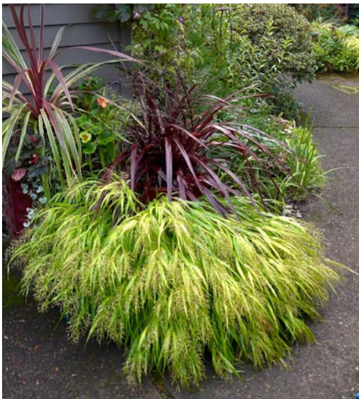
Private garden in Portland

begins with a visit to the International Rose Test Garden where we have some time on our own to 'smell the roses' and enjoy this excellent collection of roses from all over the world. Conceived in 1915, this garden was a safe haven for European hybrid roses during World War I. Afterward, we have a guided tour of the beautiful Portland Japanese Garden . Begun in 1963, the garden represents the strong connection between the people of Portland and the country of Japan. Next, we make our way to see the Columbia River Gorge and the magnificent Multnomah Falls , before returning to enjoy a get-acquainted dinner at McMenimin's Edgefield Restaurant. Lodging: Portland (B)(D)