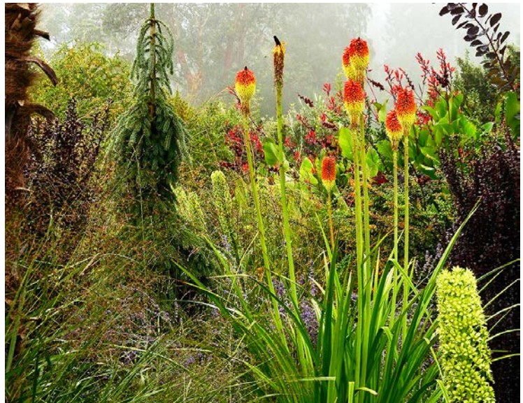
Dan Hinkley's garden, Windcliff

We gather in the lobby this morning to meet our guide for our walking tour of Pike Place Market . We then drive to the base of the Space Needle to see Chihuly Garden and Glass , a museum and outdoor space devoted to Tacoma's world famous glass artist, Dale Chihuly. We finish the day with a short drive to Medina in east Seattle to visit a remarkable private garden there. Lodging: Seattle (B)